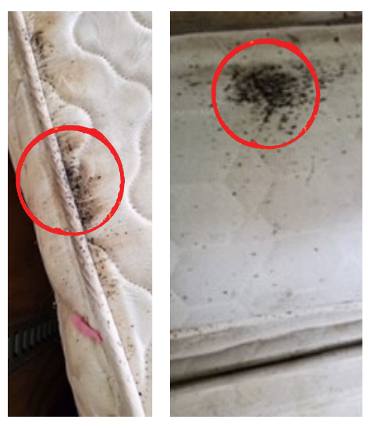
Bed bugs are circled in red.

1) Mattresses or box springs with bed bugs will be rejected and sent to the landfill for disposal.